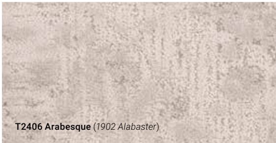
T2406 Arabesque (1902 Alabaster)

Inspired by the multi-directional lines and imprecise beauty of handwoven textiles, Arabesque adds a layer of texture with a slightly contemporary feel. Each of the collection's six fashionable shades is made with 100% solution-dyed fiber and built-in resistance to pet stains, soil and spills. Protected with a Lifetime Warranty.