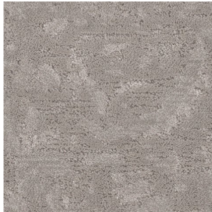
1903 Powder Gray