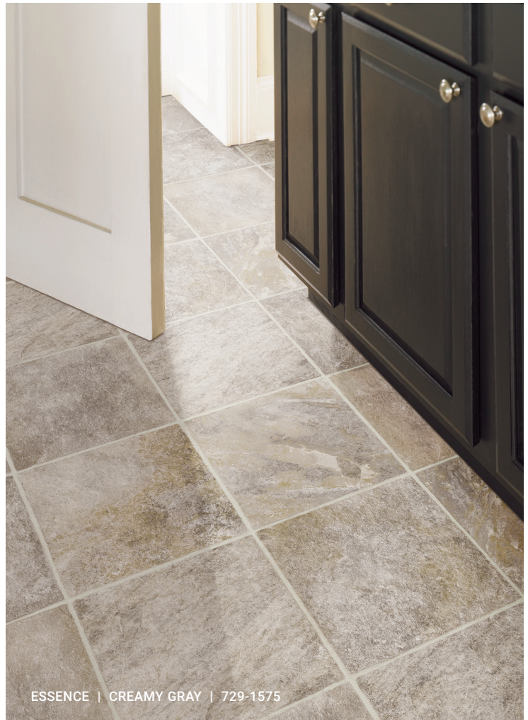
ESSENCE | CREAMY GRAY | 729-1575